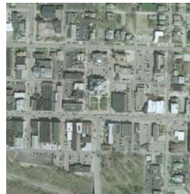
Downtown Cambridge, OH

the new road centerline project, the GIS foundation will be in place. We would then